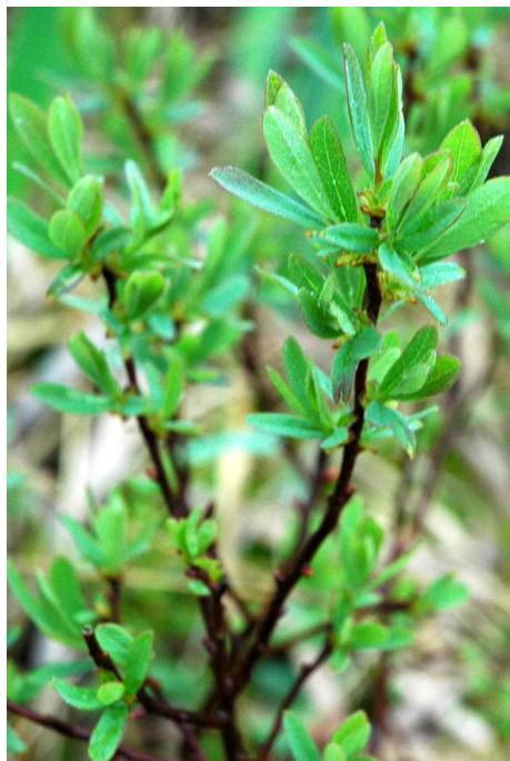
Myrica Gale leaves