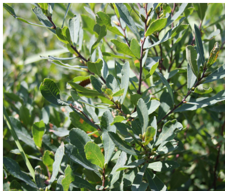
Sweet gale, Myrica gale, plant.

yellow dye and have also been used to improve the flavor and foam of beer before replacement by hops. Leaves are also insecticidal (campers have placed plants in tents for bug control). Varieties have been developed for gardens.