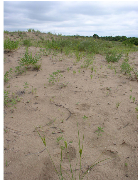
Grey Cloud Dunes Scientific and Natural Area, Washington County

The symposium will be held Saturday, March 27, at the Bell Museum of Natural History on the University of Minnesota campus, Minneapolis. Watch for a brochure with details.